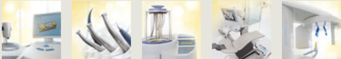
CAD/CAM SYSTEMS | INSTRUMENTS | HYGIENE SYSTEMS | TREATMENT CENTERS | IMAGING SYSTEMS

Sirona develops and manufactures a comprehensive range of dental equipment, including CAD/CAM Systems for dental practices (CEREC) and laboratories (inLab), Instruments and Hygiene Systems, Treatment Centers and Imaging Systems. Sirona manufactures high technology products that guarantee ease of use and a high return on investment – for the good of your practice and for the benefit of your patients. In this way, you can approach every challenge that you face, confident in the knowledge that: It will be a great day. With Sirona.