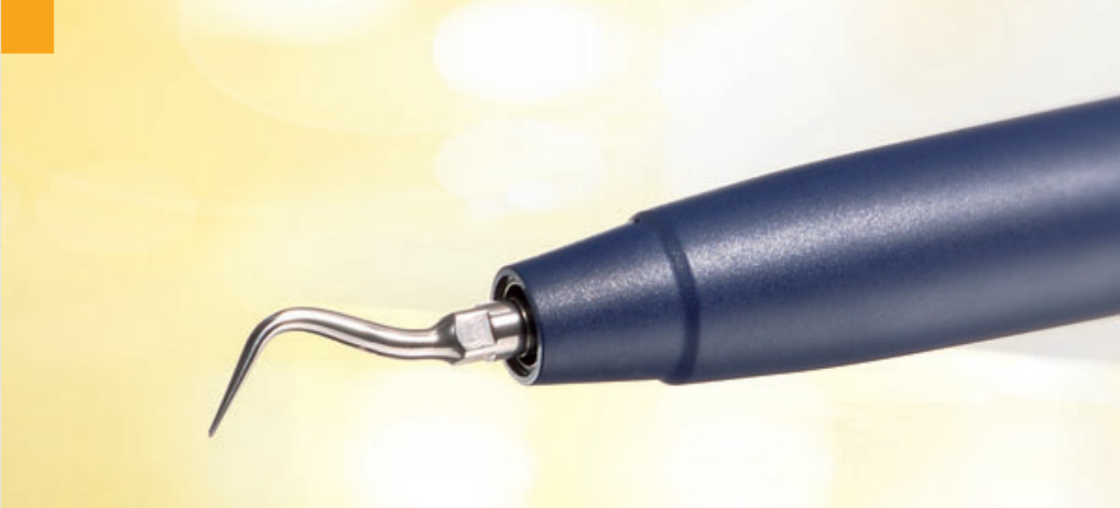
CAD/CAM SYSTEMS | INSTRUMENTS | HYGIENE SYSTEMS | TREATMENT CENTERS | IMAGING SYSTEMS

Sirona Dental Systems · Fabrikstrasse 31 · D-64625 Bensheim E-mail: contact@sirona.de · www.sirona.com